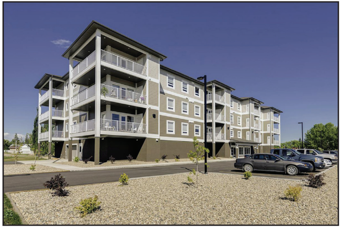
Exterior Rendering of Heartland Estates with Parking

Elmhurst Gypsum Flooring Inc. has been a licensed installer of FIRM FILL® products since 1992. In that time, they have installed FIRM FILL® GCU, as well as FIRM FILL® SCM acoustical control mats, in residential and commercial properties across Manitoba, Saskatchewan and Northwestern Ontario. For more information on Elmhurst Gypsum Flooring, Inc., as well as their other construction businesses, visit them online at www.elmhurstgroup.ca.