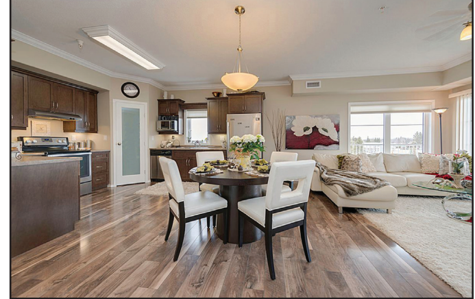
Wood laminate installed over 1" of Firm-Fill® 3310+