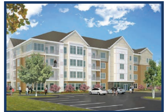
Arborpoint at MarketStreet in Lynnfield, MA