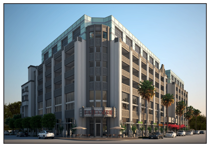
The Mansfield Apartments

The Korda Group commissioned Plus Architects to design the mixed-use building with the luxury amenities residents expect, as well as the quiet living space they demand. Amenities include lofts with 18-foot ceilings, private balconies, pool and jacuzzi, gym, lounges, clubhouse, dog wash, and an outdoor movie