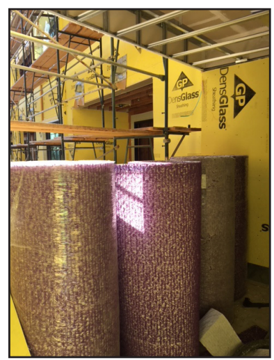
Rolls of SCM-400 staged before install

Westside Contractors, Inc. was chosen as the general contractor. To keep with the Korda Group's vision