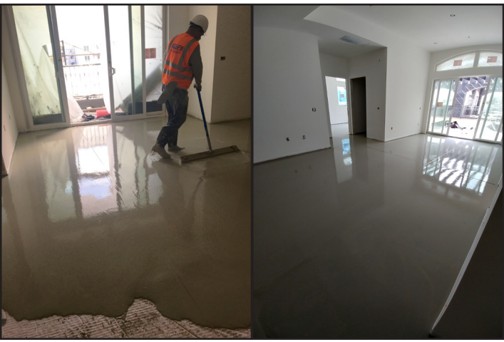
Troweling the 2010+ as it's pumped over the SCM-400