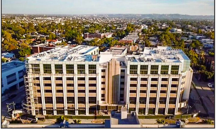
The Mansfield during construction, set in its West Los Angeles neighborhood